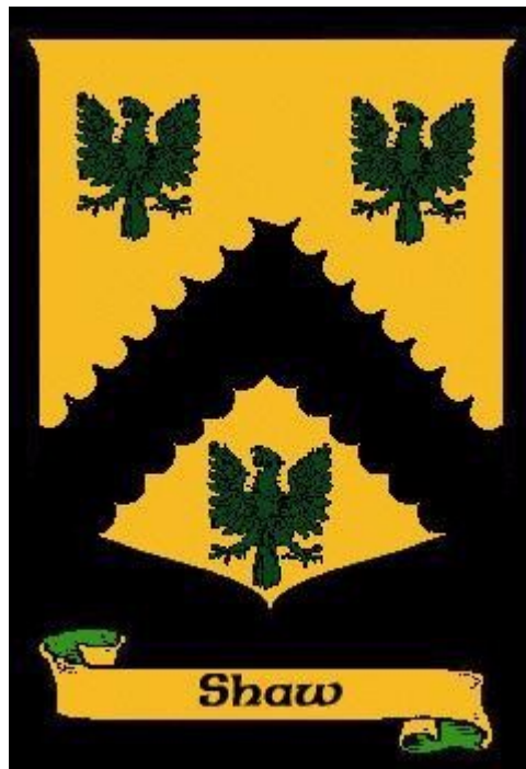
Shaw coat of arms

The name Shaw in Ireland is of Scottish origin having been brought to Ulster in the 16 th century by settlers of the Mackintosh Clan. Descendants bearing this name can be found in all four provinces but the highest density is still in the province of Ulster. The Shaw family name bears the motto ' fide et fortitudine ' which means 'by fidelity and fortitude'.